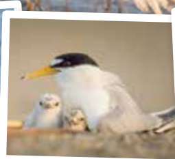
California least tern