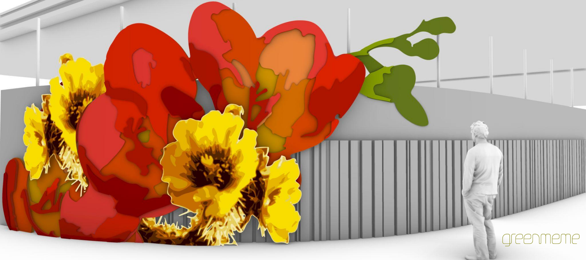
IMAGE: Sculptural "Bouquet" of both native and cultivated flowers at North Western entrance to the Underpass