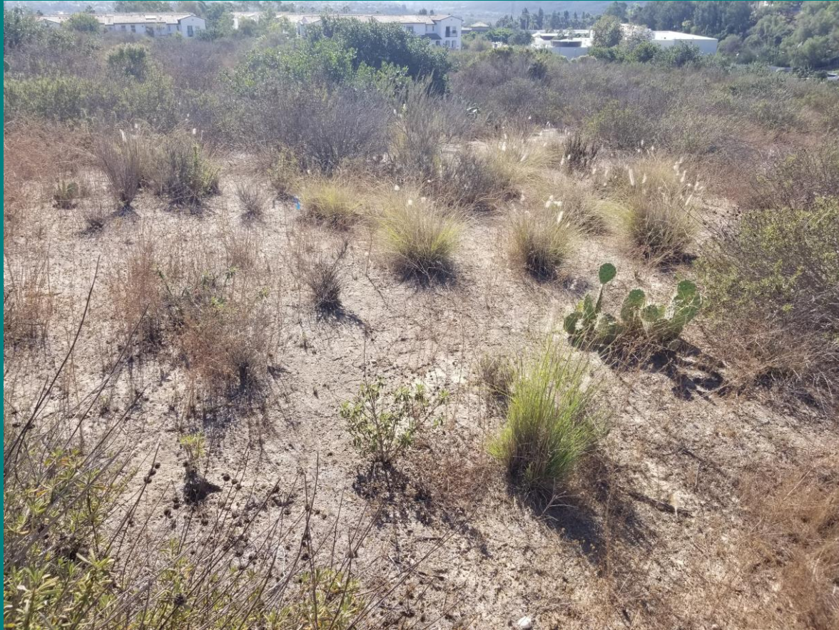
Before Fountain Grass Removal